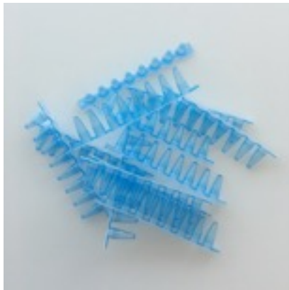
Figure 1. “Current” Step 1 tubes, 30 x 8-well strip tubes (240 samples).

We are making changes to the products that you order. AusDiagnostics will be replacing the “current” Step 1 tubes (see Figure 1) with a new format of Step 1 tubes (see Figure 2). The “new” Step 1 tubes consist of a 96-well frame containing 12 x 8-well strip tubes which “pop” out for use, every well will be individually foil sealed. There is no change to the formula the Step 1 tubes contain, just a change to the tube format.